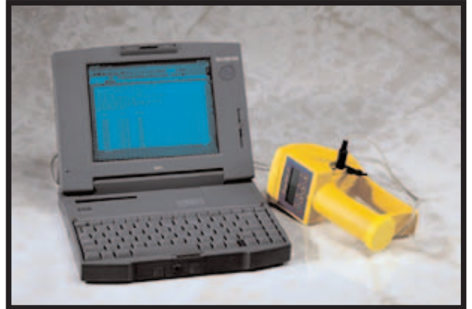
Computer interface is a standard feature of the PortaSens II. An RS-232 output allows stored data to be downloaded to a PC through an interface cable supplied with the unit. Software is provided to allow simple data transfer.

Sensors used in the PortaSens II are ATI's newest miniaturized smart sensor modules. Each sensor module is actually a sensor, amplifier, and memory module in one compact package. Because of this design, sensor modules can be calibrated independently and simply plugged into any detector for immediate use. When installed in a detector, calibration data is loaded into the microprocessor so that no adjustments are needed. The result is that a detector can, for example, go from phosgene measurement to ammonia measurement in less than one minute.